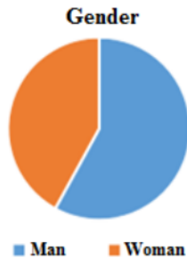
9 Figure 1. Characteristics of Respondents Based on Gender

Based on the results of distributing questionnaires to 100 respondents, the characteristics of respondents based on gender were obtained which are presented in the following picture: