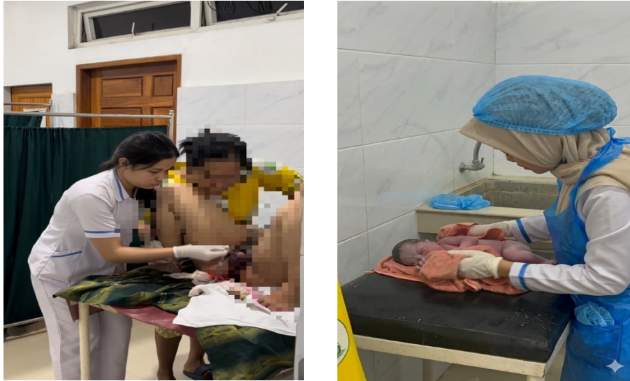
Figure 3. Delivery and Immediate Newborn Care

Table 3 shows that the delivery resulted in favorable maternal and neonatal outcomes. The newborn had good immediate adaptation, as indicated by spontaneous crying, active movement, normal coloration, and an Apgar score of 9. The mother remained stable after delivery, with adequate uterine contraction and no reported abnormal postpartum bleeding. The second-degree perineal laceration was repaired appropriately.