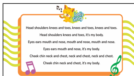
Picture 2. Song about body parts