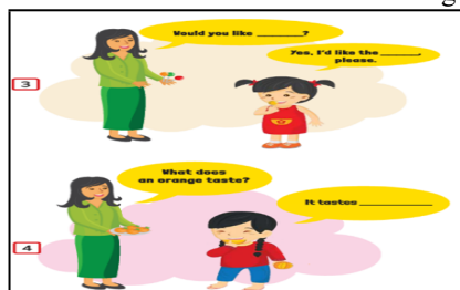
Picture 3. Conversational writing practice