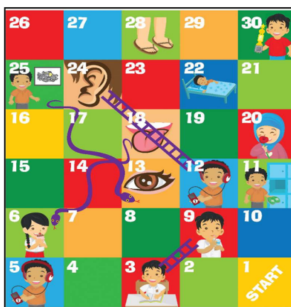
Picture 1. Snakes and ladders game Source: My Next Words Grande 5. 2021. Page 61.

In the book "My Next Words" there are many interesting and varied lessons and characters, which can help children not get bored easily in the learning process. Apart from being interesting in the form of good and colorful pictures, there are also games that children can play so that the learning atmosphere doesn't feel tense and the teacher can easily explain the material.