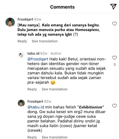
Figure 3. Active Discussion through Comments on Instagram Posts

Social media listening activities encompass socialization and externalization. In these activities, members from the communication team share knowledge and experiences, and respond to opinions from external parties of Tabu.id. This process facilitates the exchange of knowledge and the creation of new information. Externalization involves converting insights from social media listening into explicit knowledge in the form of documents.