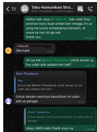
Figure 1. Unscheduled Informal Discussion Example

Informal discussions can be considered a form of socialization because they involve the exchange of knowledge and experience on various issues, allowing each individual to gain a clearer understanding of the knowledge. This knowledge is then shared among the members involved or with Instagram followers, resulting in new insights.