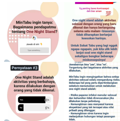
Figure 2. Instagram Stories Content that Addresses Relationship Topic

Selected reactions, such as opinions or personal stories shared in the question box, are addressed by Tabu.id either by creating new Instagram Story content or by sending a personal message to the account owner who provided the reaction. This process involves an interaction where knowledge and experiences are shared, leading to the creation of new knowledge, especially in the realm of comprehensive sexual education.