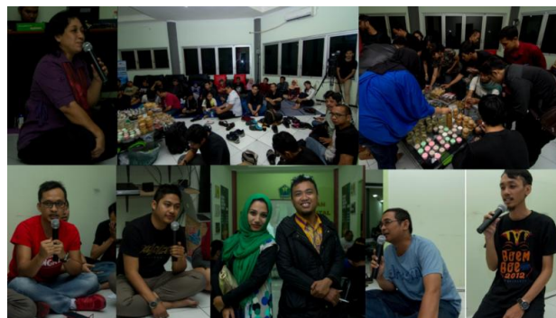
Figure 5. Creative Community Discussion Forum as a Space for Exhibiting Ideas and Media Arts Works

This transformation aligns with Walter Benjamin’s argument (Hardiman, 2021) regarding the shift from cult value to exhibition value . According to Benjamin, the significance of artworks is no longer derived primarily from their exclusivity or sacredness, but rather from their ability to be exhibited, experienced, and appreciated by broader audiences.