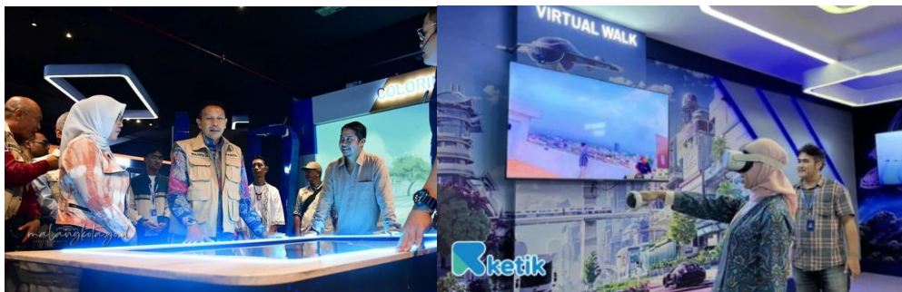
Figure 2. Utilization of Digital Technology in Media Arts Practices in Malang City

According to Benjamin’s concept of technical reproducibility ( Hardiman, 2021), technological developments enable artworks to be reproduced and distributed beyond physical spaces. Consequently, reproduction technologies transform the ways artworks are created, circulated, and consumed. In the context of Malang, digital technology enables creative works to be repeatedly produced, widely distributed through digital platforms, and accessed by increasingly diverse audiences.