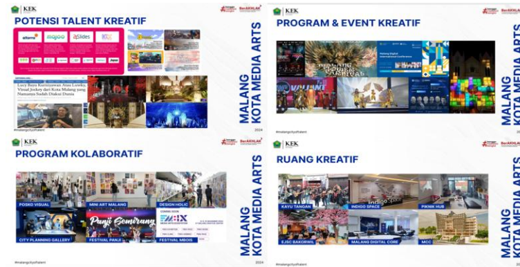
Figure 4. Media Arts Ecosystem Infrastructure in Malang City

industry sectors (Febriani et al., 2025). This finding indicates that media arts production has evolved from an individual activity into a networked process of creative production that supports the reproduction of works across various media formats (Hardiman, 2021).