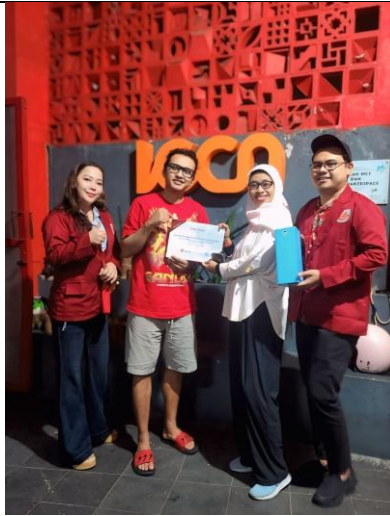
Figure 6. Archival Exhibition of the Development of the Media Arts Ecosystem

The figure presents a visual documentation of the historical development of the media arts ecosystem in Malang City through a chronological exhibition format. The visual archive highlights various creative activities, collaborative programs, and community developments that have shaped the city's media arts ecosystem. By presenting these archives as a public exhibition, the history of the creative industry is not merely preserved as documentation but is reintroduced as a representation of the city's creative journey. The exhibition demonstrates how diverse creative practices have become part of a collective narrative that contributes to the construction of a creativity-based urban identity.