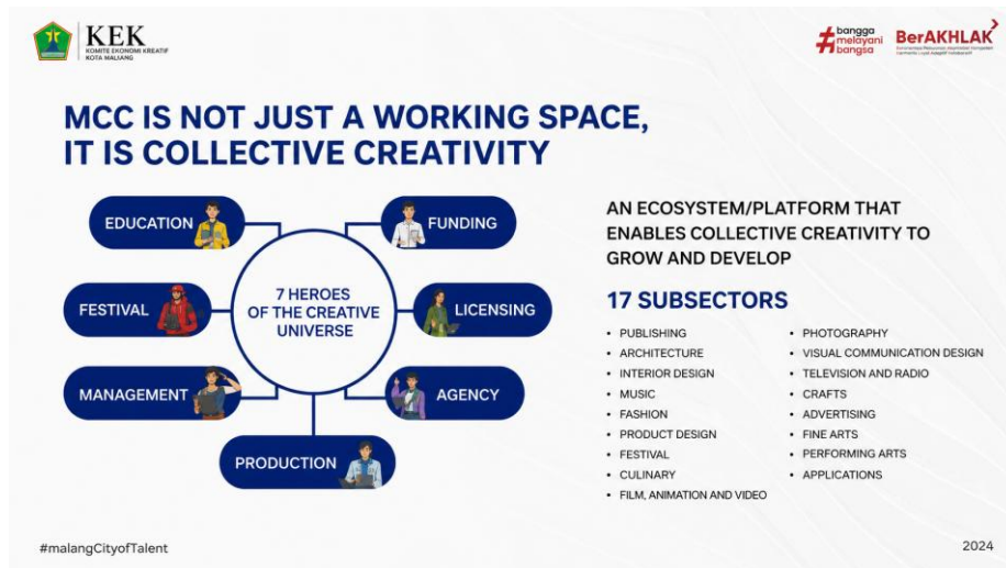
Figure 3. Media Arts Production Ecosystem at Malang Creative Center

Figure 2 illustrates the use of interactive screens and technology-based visual media in Malang’s media arts practices. These technologies allow creative content to be presented directly to visitors while creating dynamic visual experiences. The digital presentation of artworks facilitates updates, reproduction, and dissemination, thereby enhancing public accessibility. This development demonstrates that media arts are no longer confined to physical objects but have evolved into digital forms that enable continuous reproduction and broader public engagement, reflecting Benjamin’s notion of technological reproduction and distribution ( Hardiman, 2021).