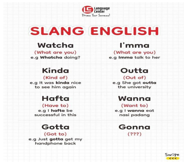
Figure 1 : English vocabulary visual learning media

The example image above is a Visual Media, which is a learning medium that can only be seen and analyzed for its meaning. This media can be used as one of the English language learning tools. Using relevant pictures or illustrations related to the topic being taught can help students understand new words, phrases, or concepts. For example, if students are learning animal vocabulary, pictures of animals can assist them in associating words with the corresponding images.