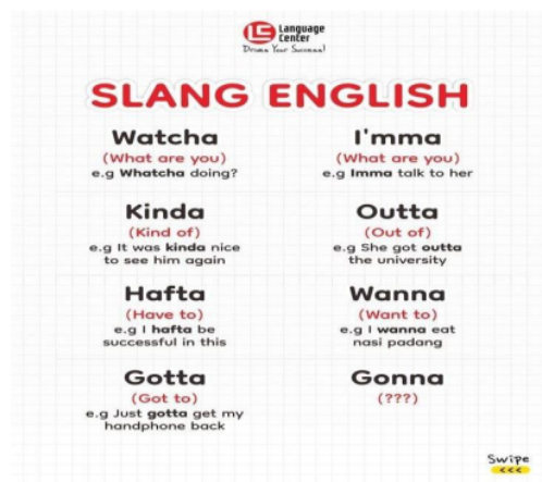
Figure 1 : English vocabulary visual learning media

The example image above is a Visual Media, which is a learning medium that can only be seen and analyzed for its meaning. This media can be used as one of the English language learning tools. Using relevant pictures or illustrations related to the topic being taught can help students understand new words, phrases, or concepts. For example, if students are learning animal vocabulary, pictures of animals can assist them in associating words with the corresponding images.