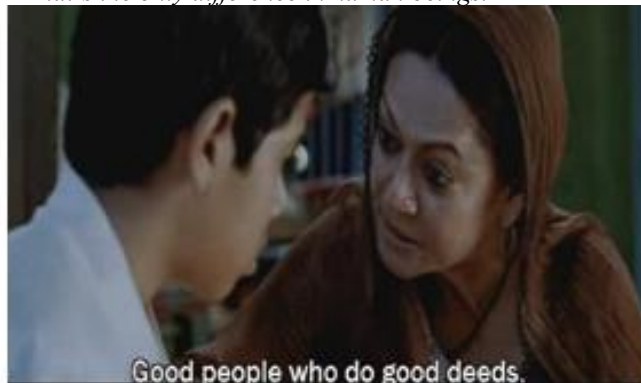
Figure 1. Khan mother tries to explain to Khan

Good people who do good deeds. And bad people who do bad. That's the only difference in human beings.