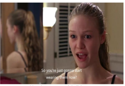
Kat is angry with Bianca

Kat: Where'd you get the pearls? Bianca: They're mom's