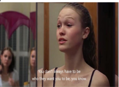
Kat giving advice to Bianca

Bianca: Why don't you try being nice? People wouldn't know what to think.