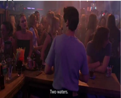
Kat asks for water at the bar

Datum number 20 (drinking to comply her Id)