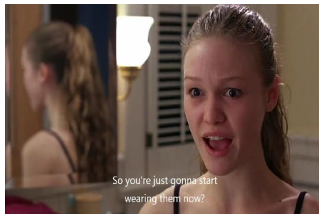
Kat is angry with Bianca