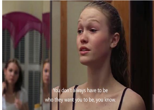
Kat giving advice to Bianca

Bianca : Why don't you try being nice? People wouldn't know what to think.